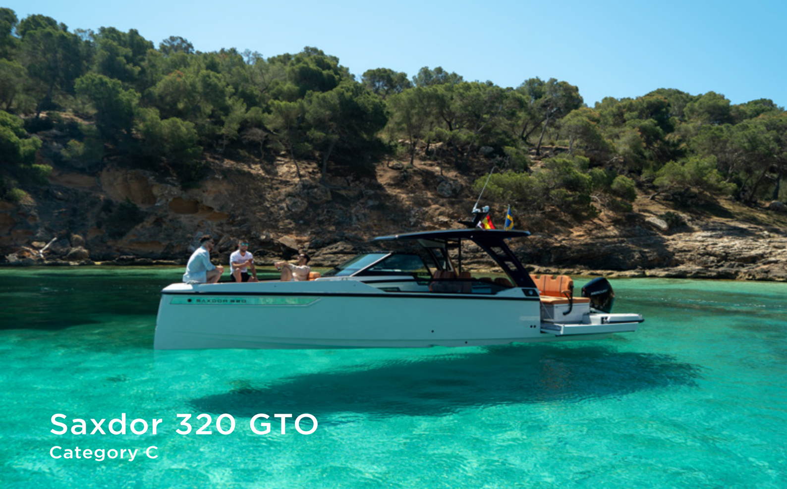
Saxdor 320 GTO Category C