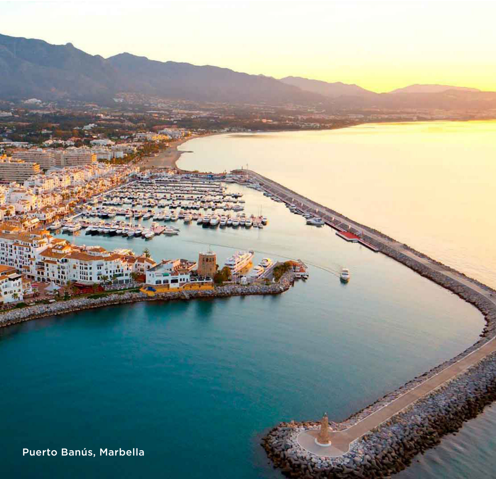
Puerto Banús, Marbella