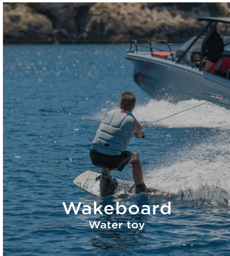
Wakeboard Water toy