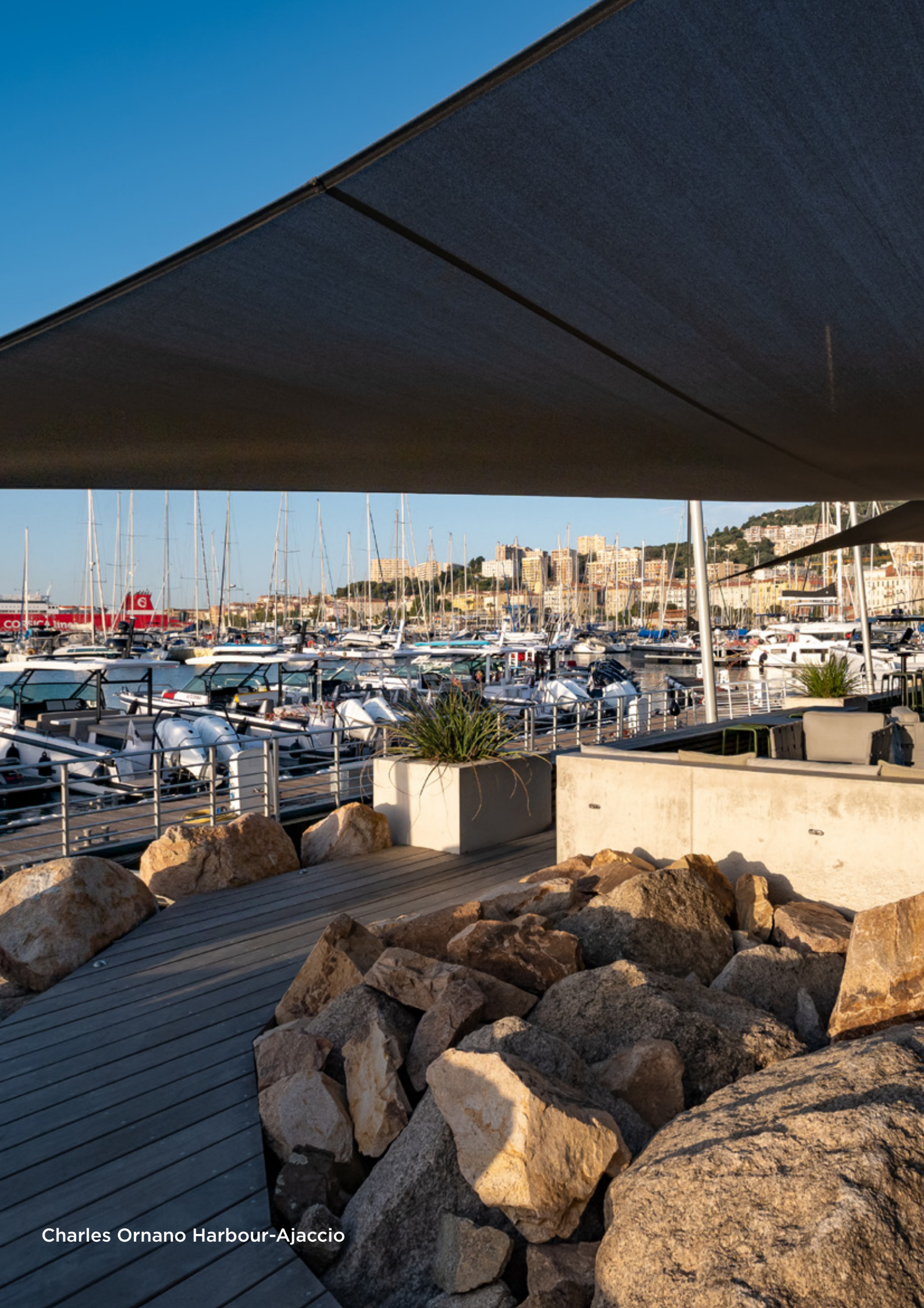
Charles Ornano Harbour-Ajaccio