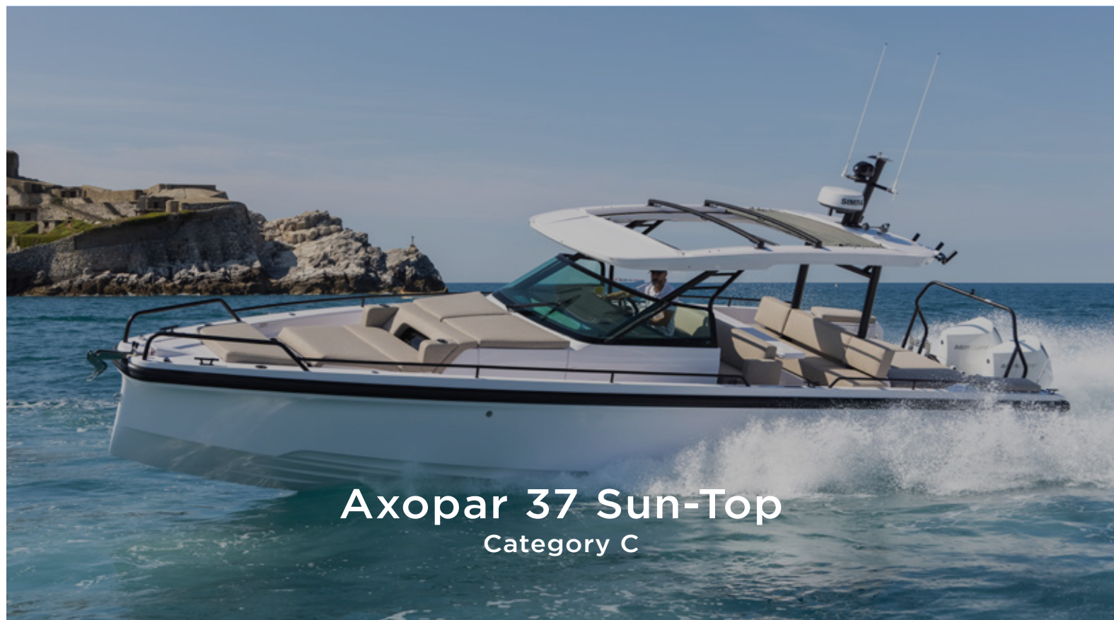
Axopar 37 Sun-Top Category C