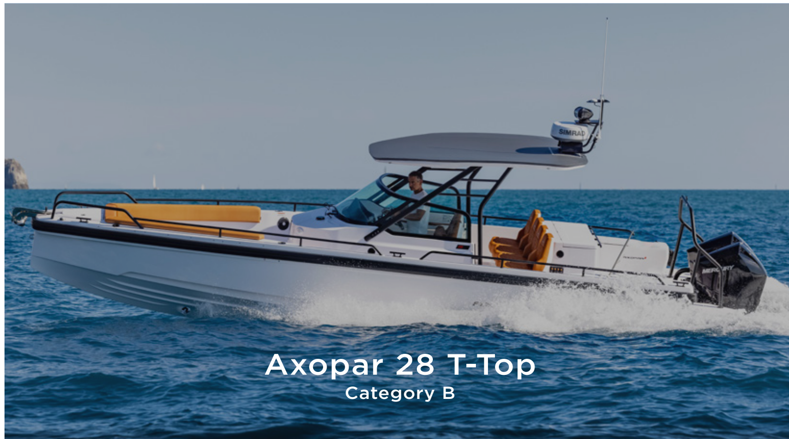
Axopar 28 T-Top Category B