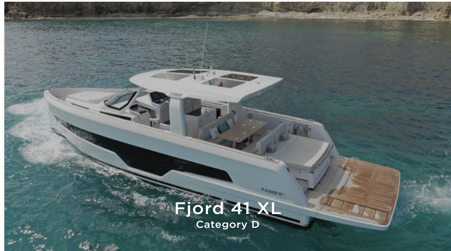
Fjord 41 XL Category D