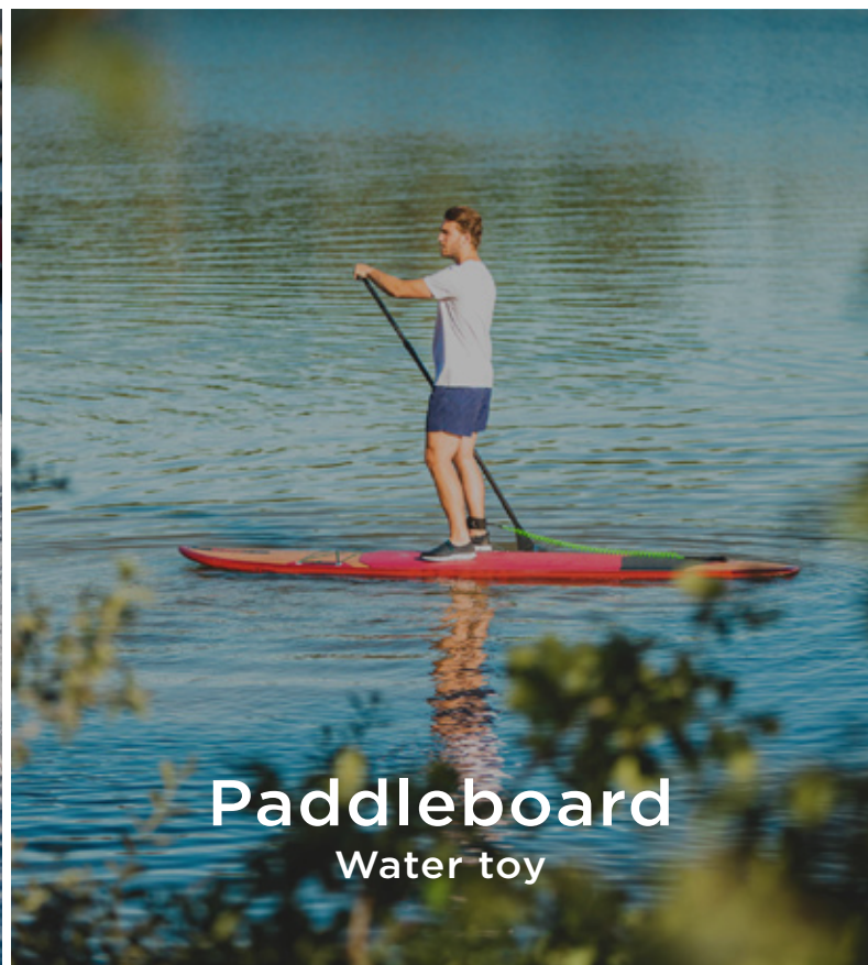
Paddleboard Water toy