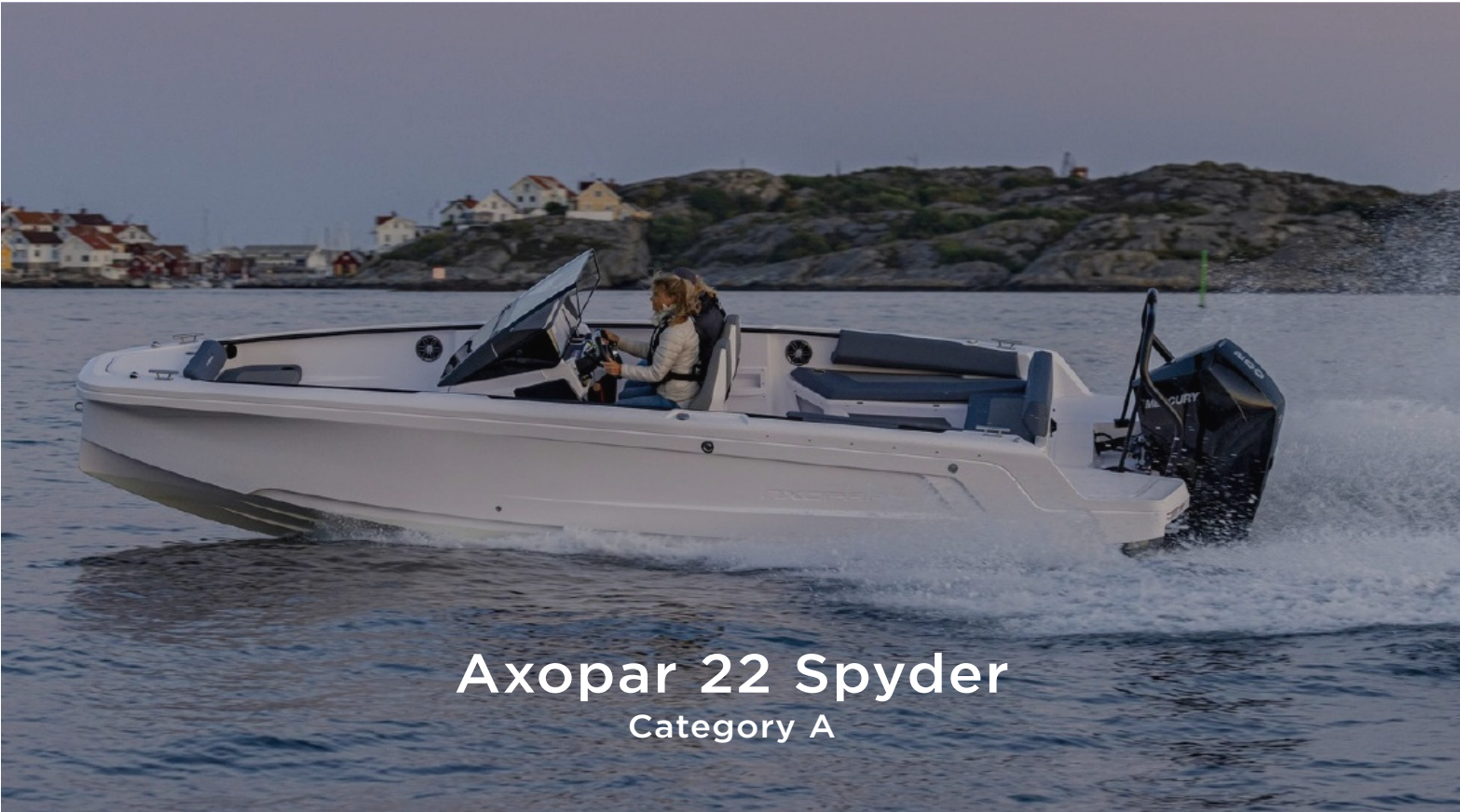
Axopar 22 Spyder Category A