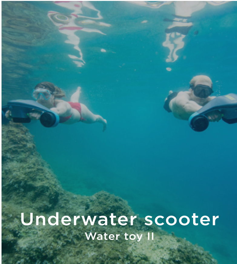
Underwater scooter Water toy II