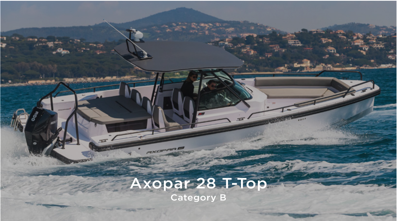
Axopar 28 T-Top Category B