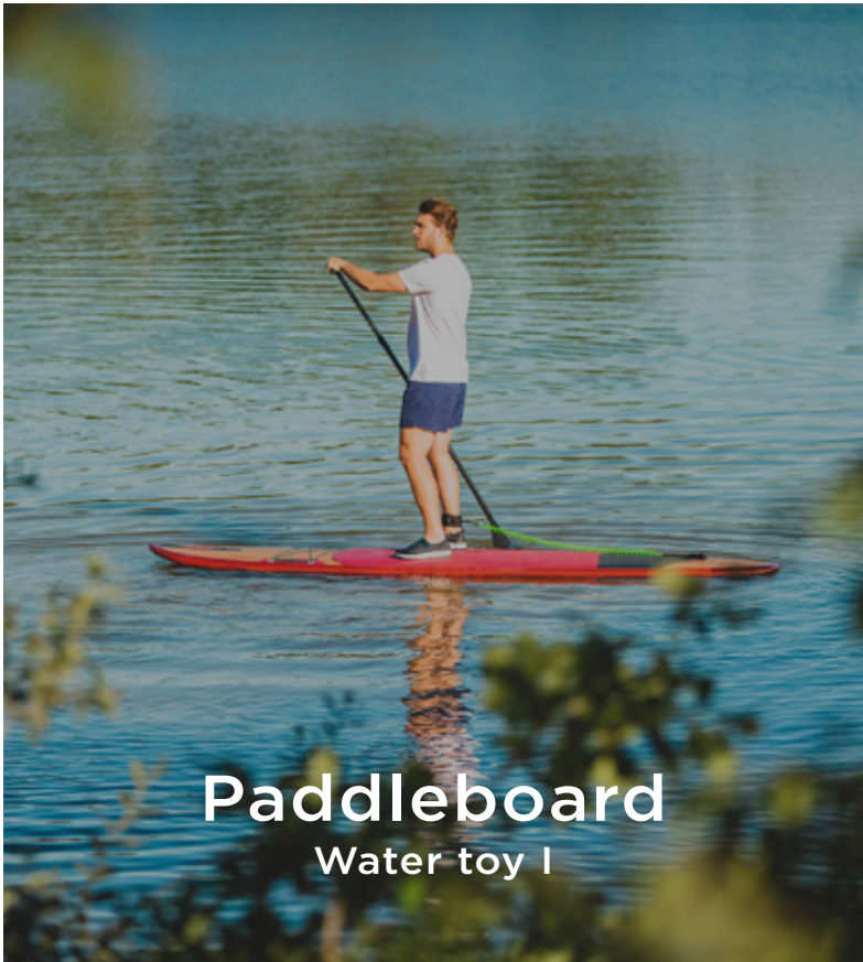
Paddleboard Water toy I