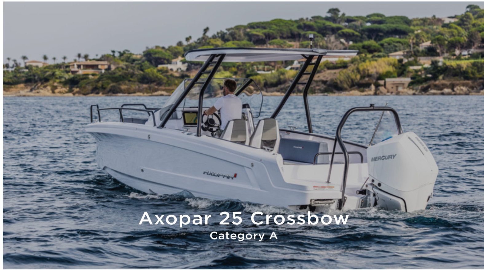
Axopar 25 Crossbow Category A