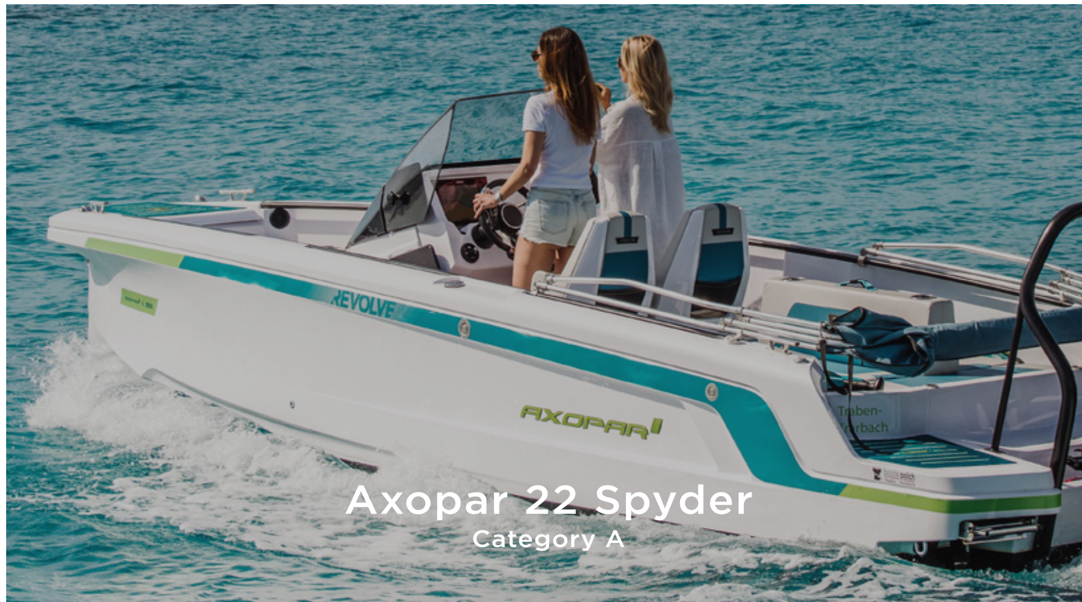
Axopar 22 Spyder Category A