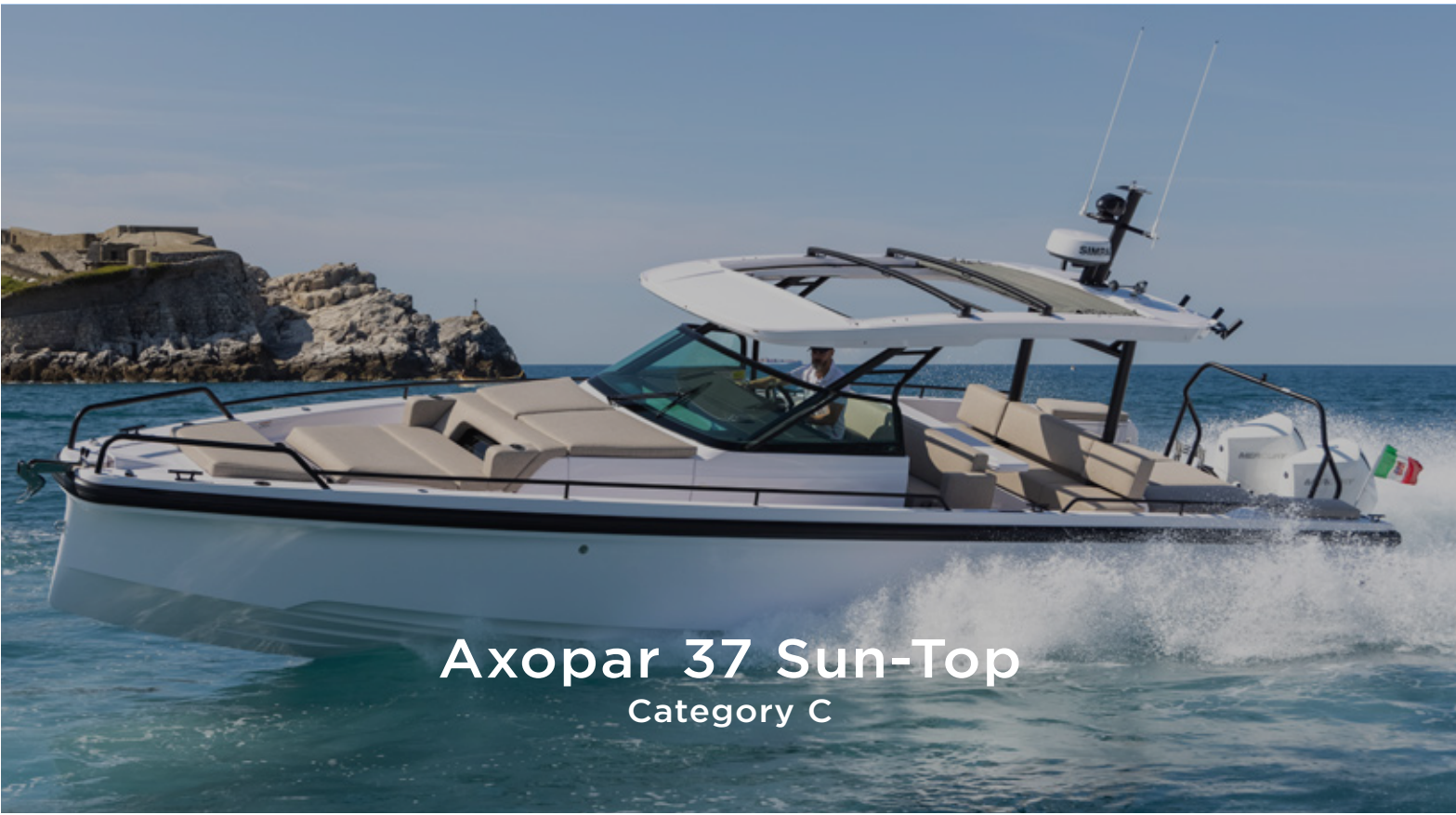
Axopar 37 Sun-Top Category C