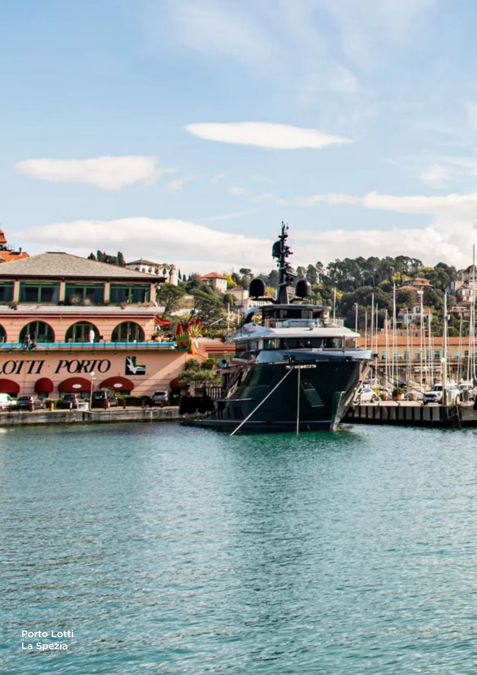
Porto Lotti La Spezia