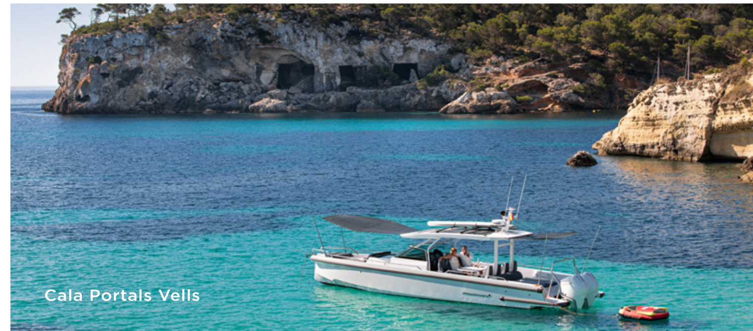
Cala Portals Vells