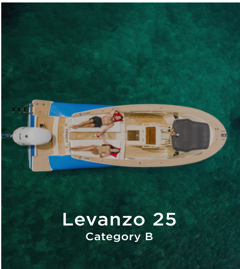
Levanzo 25 Category B