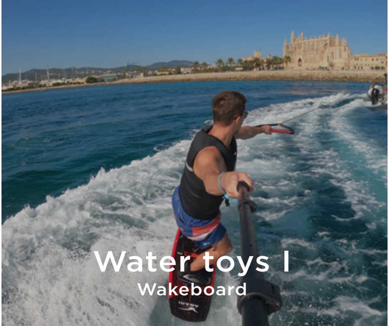
Water toys I Wakeboard