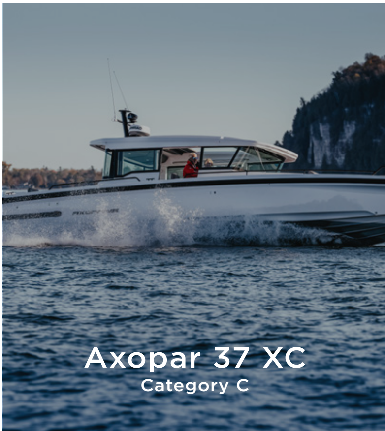
Axopar 37 XC Category C