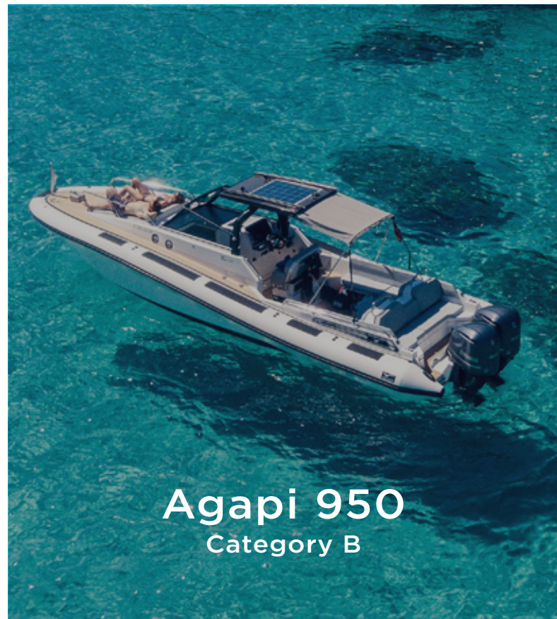
Agapi 950 Category B