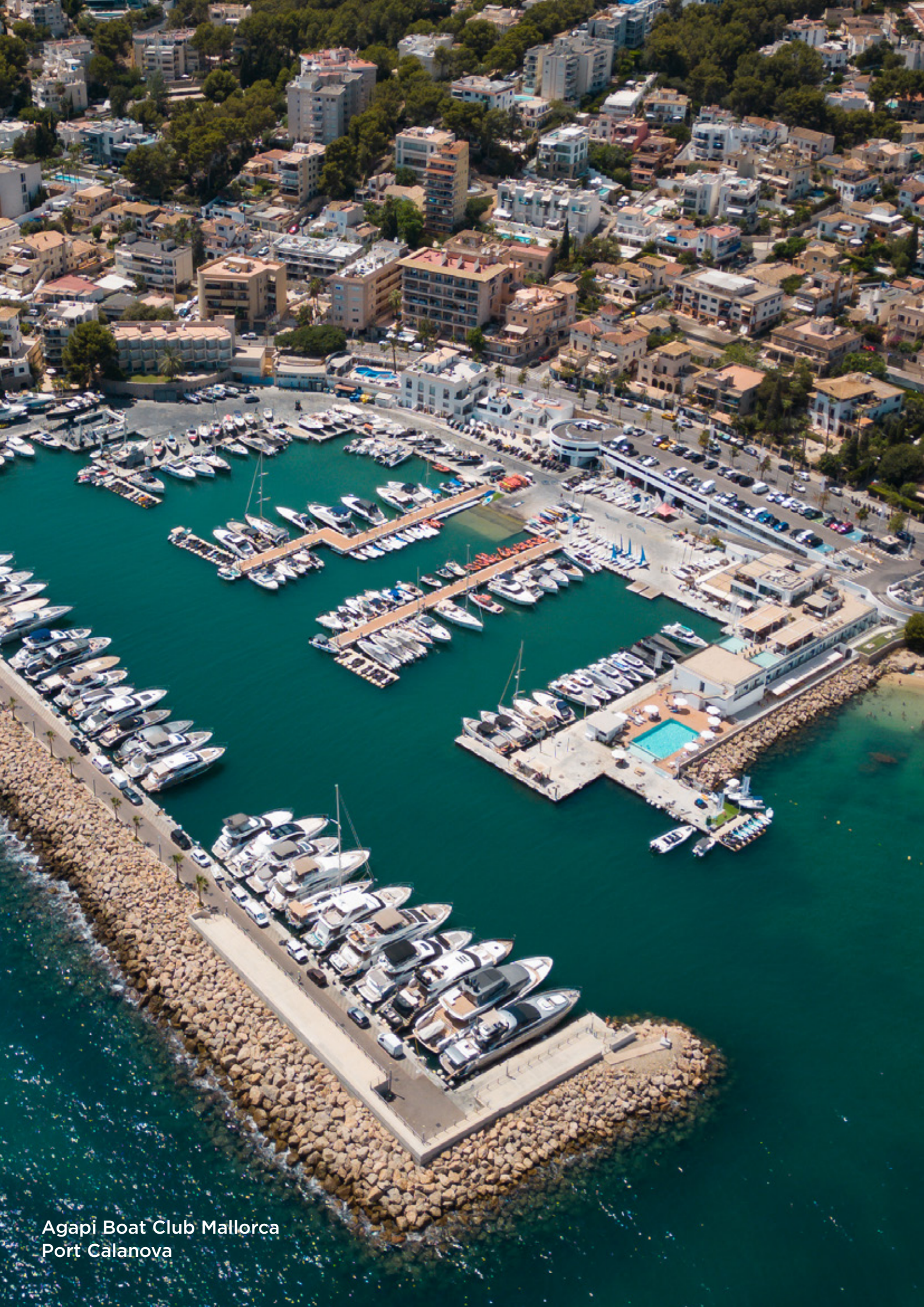
Agapi Boat Club Mallorca Port Calanova