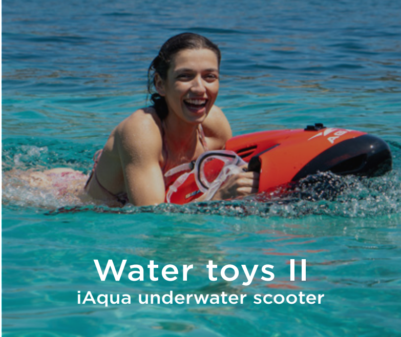
Water toys II iAqua underwater scooter