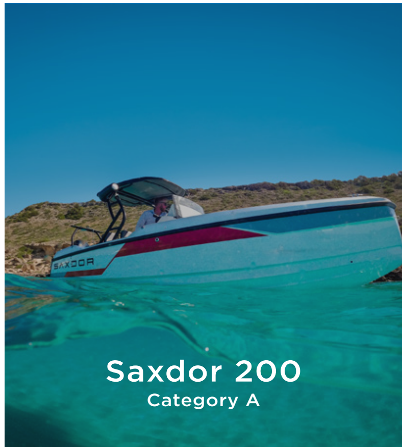
Saxdor 200 Category A