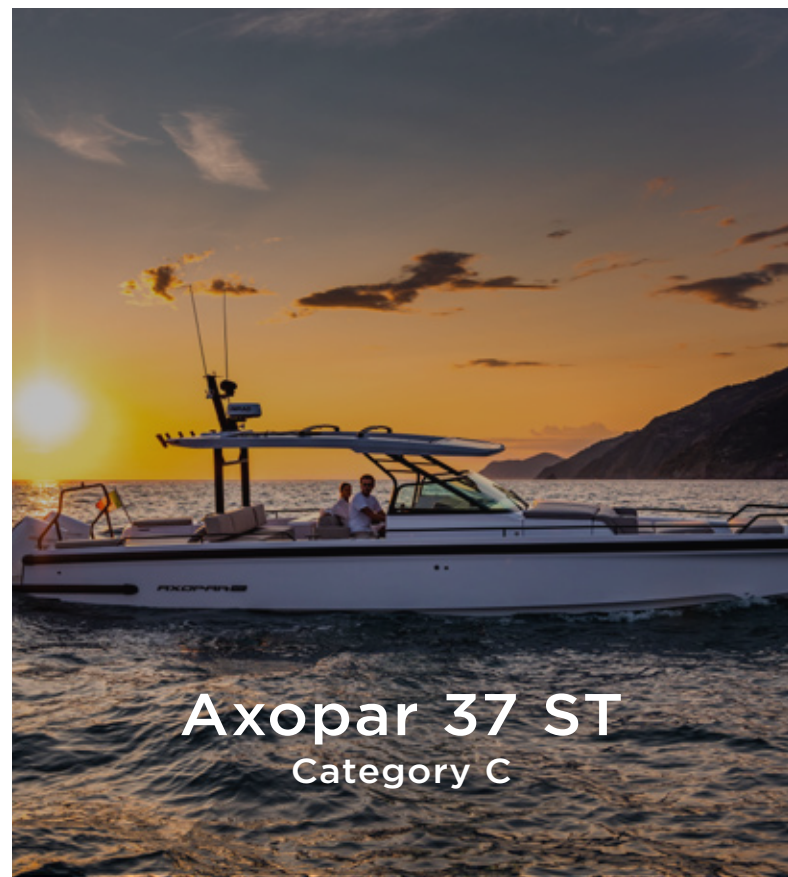
Axopar 37 ST Category C