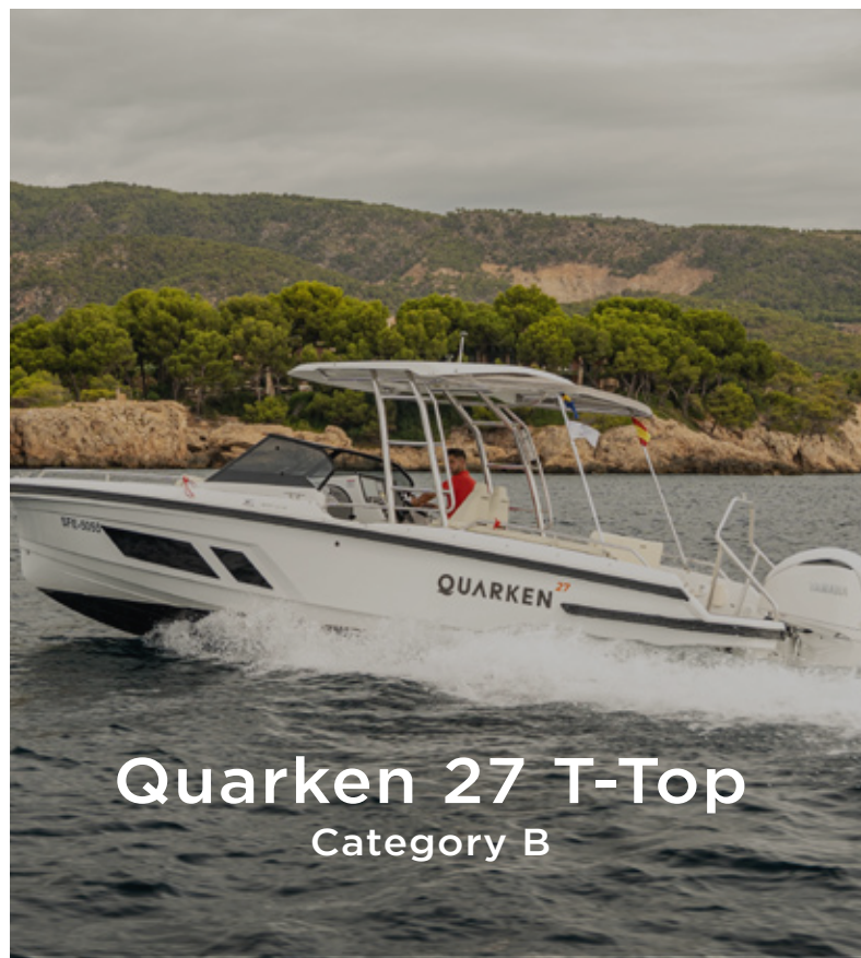
Quarken 27 T-Top Category B