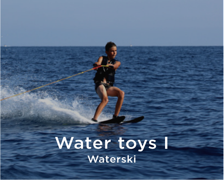
Water toys I Waterski