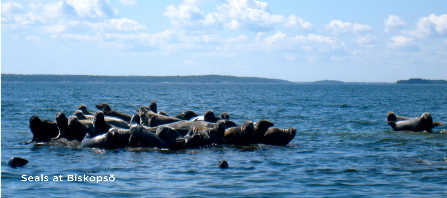
Seals at Biskopsö