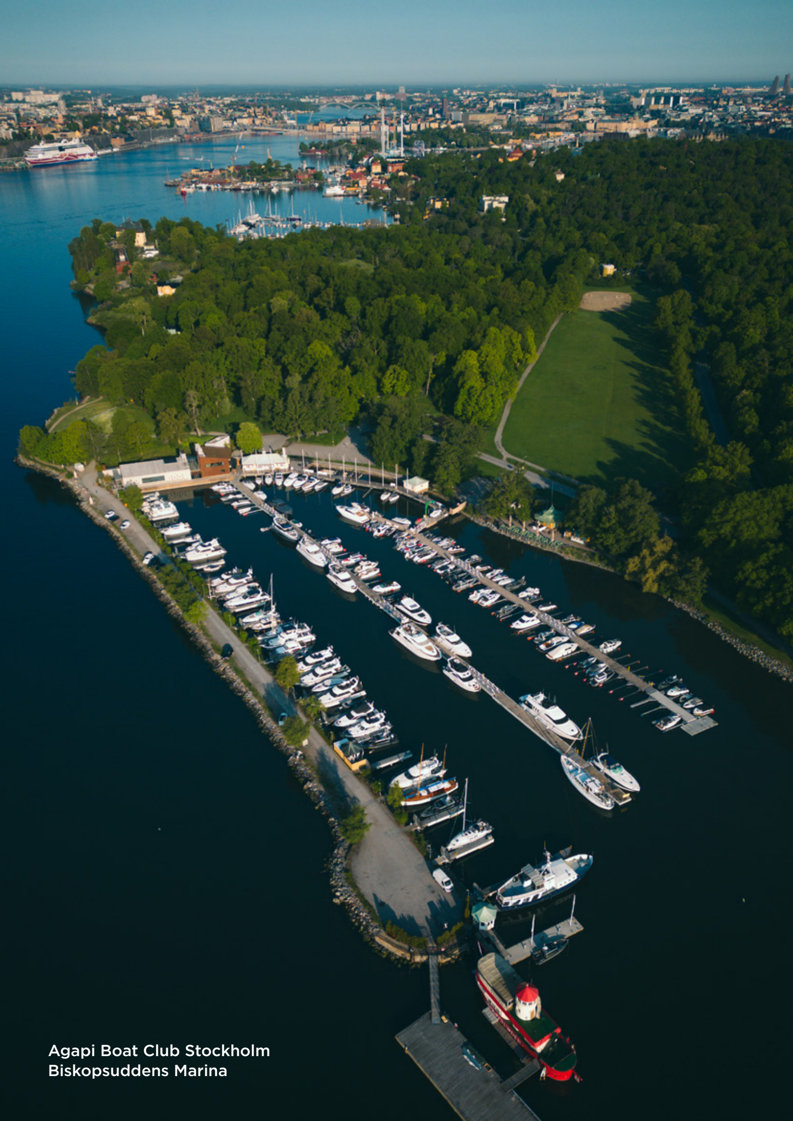
Agapi Boat Club Stockholm Biskopsuddens Marina