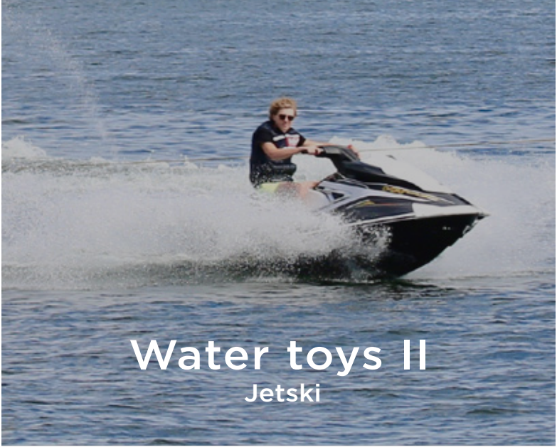
Water toys II Jetski