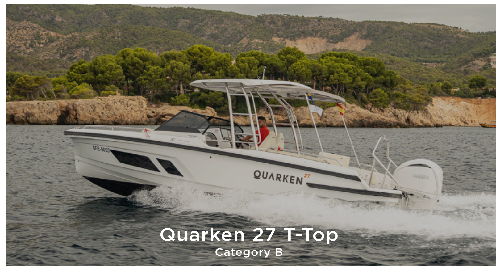
Quarken 27 T-Top Category B