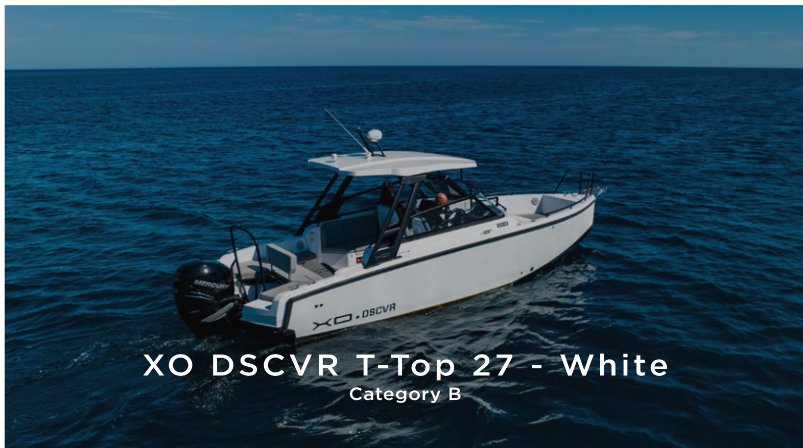
XO DSCVR T-Top 27 - White Category B