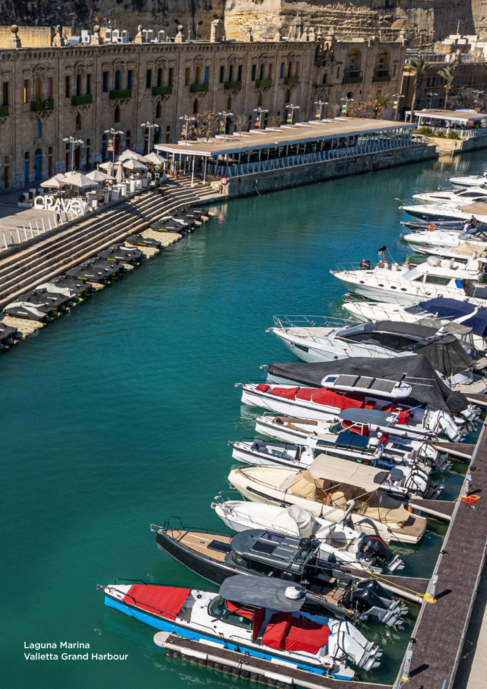
Laguna Marina Valletta Grand Harbour