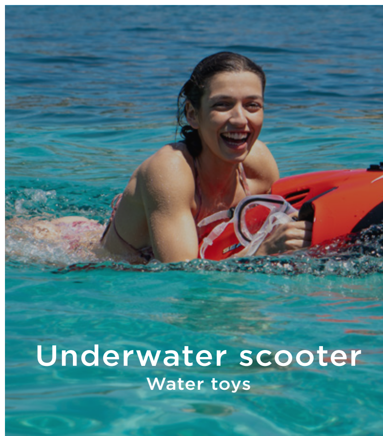
Underwater scooter Water toys