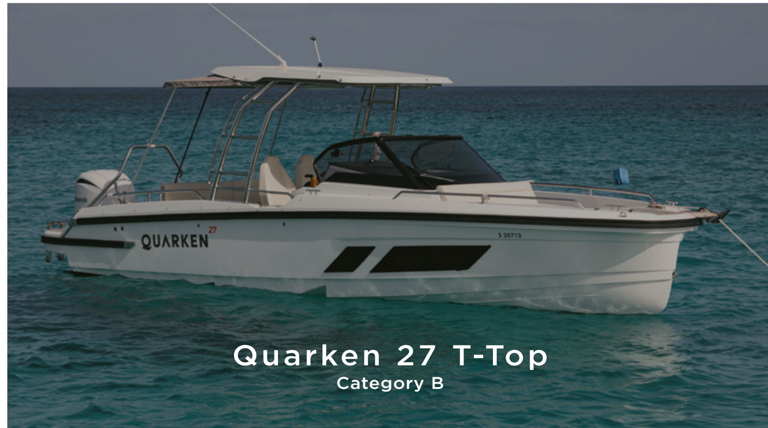
Quarken 27 T-Top Category B