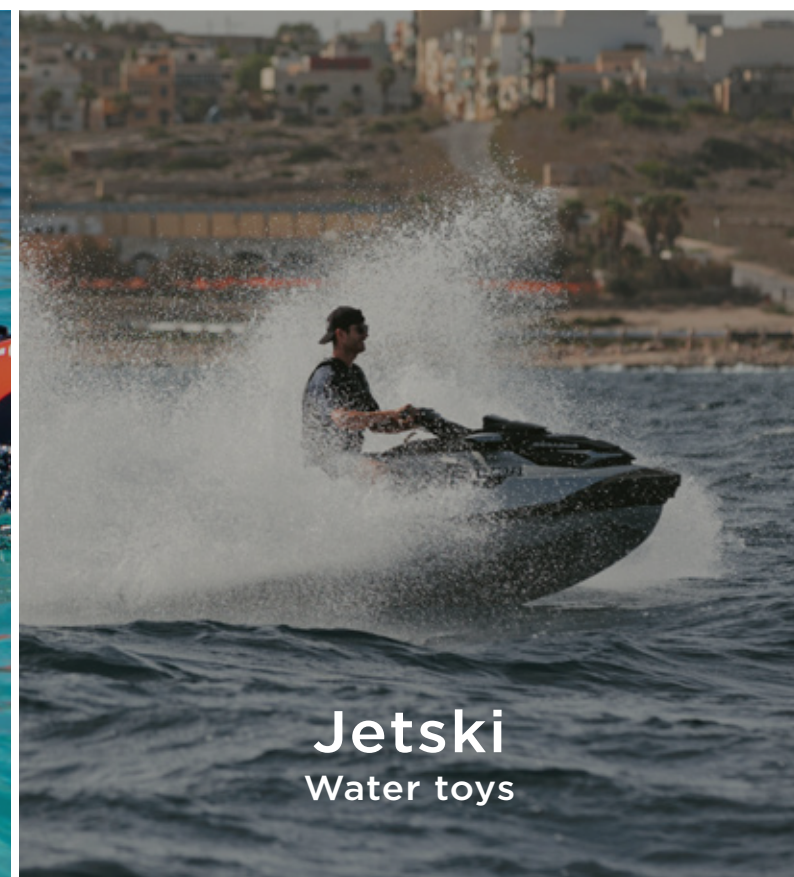
Jetski Water toys