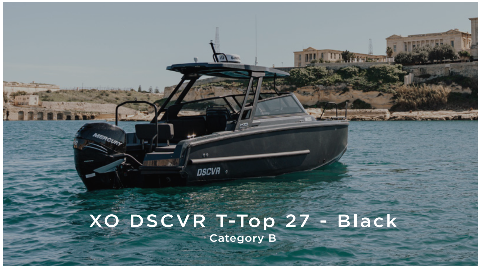
XO DSCVR T-Top 27 - Black Category B