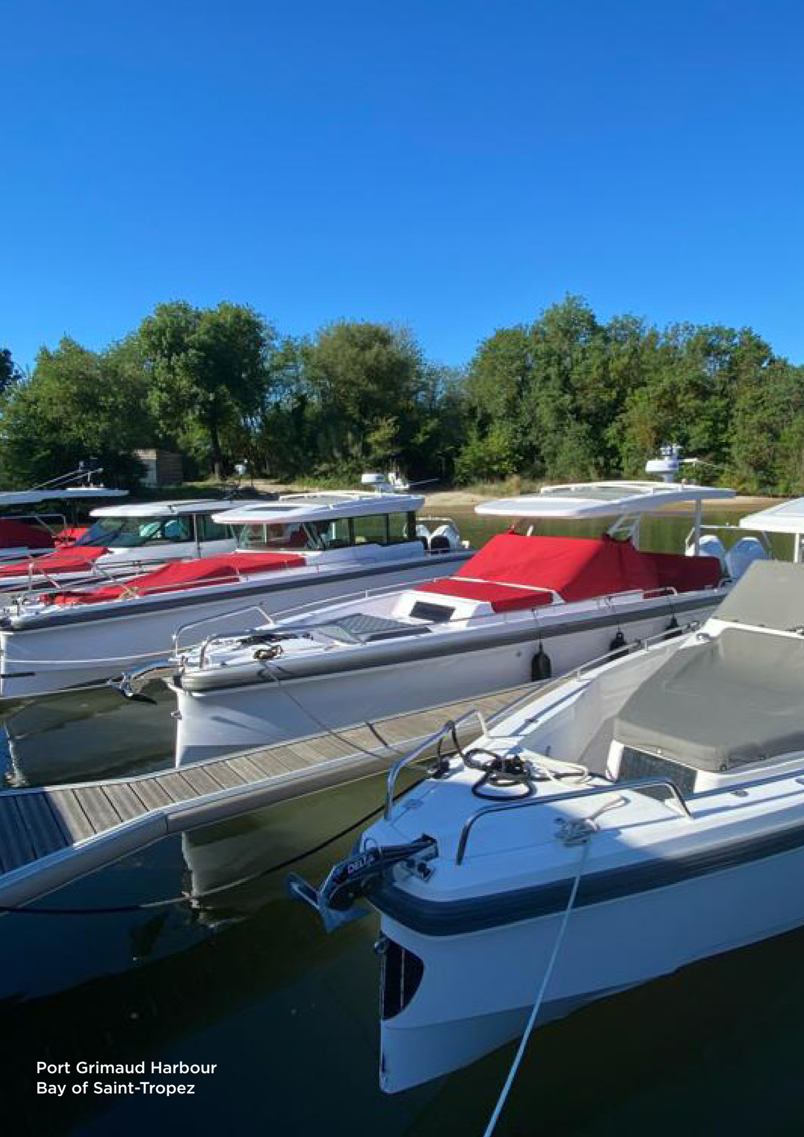
Port Grimaud Harbour Bay of Saint-Tropez