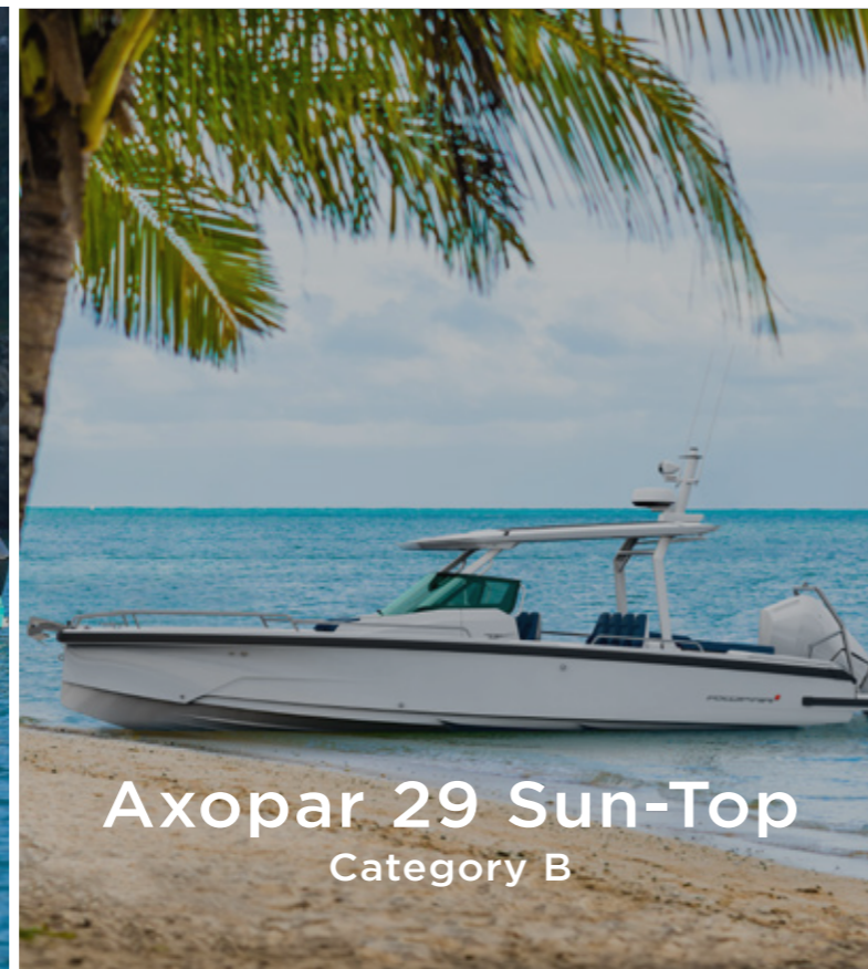
Axopar 29 Sun-Top Category B