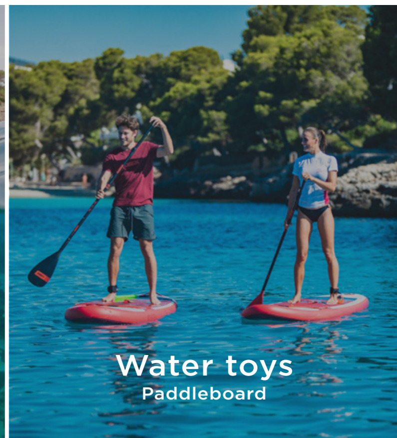
Water toys Paddleboard