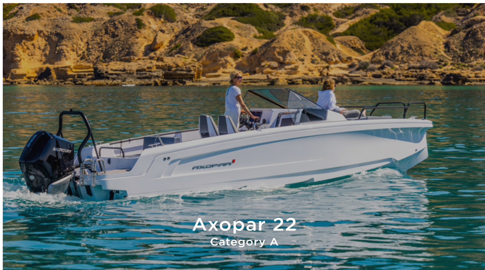
Axopar 22 Category A