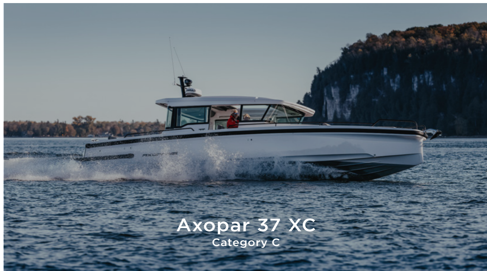
Axopar 37 XC Category C