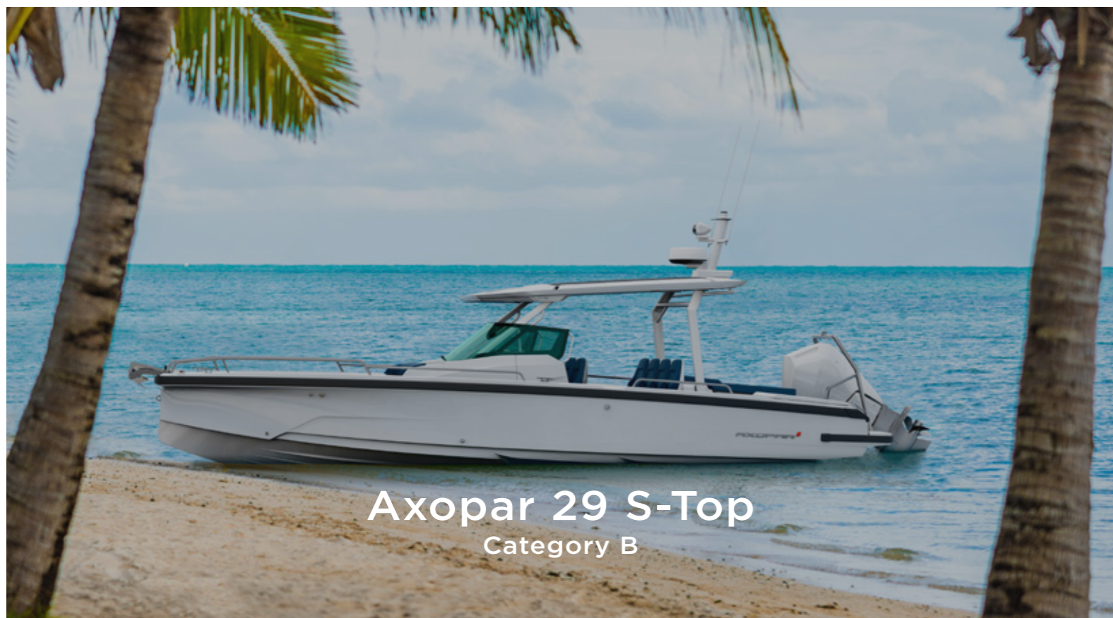
Axopar 29 S-Top Category B