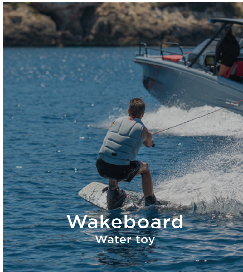
Wakeboard Water toy