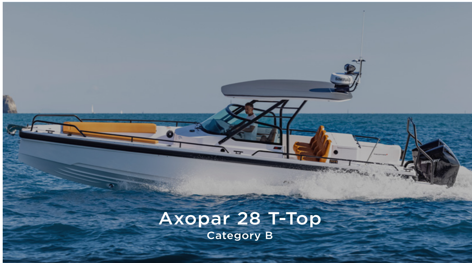
Axopar 28 T-Top Category B