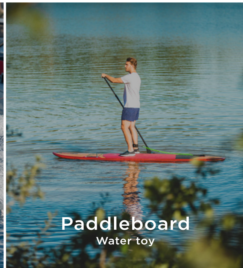
Paddleboard Water toy