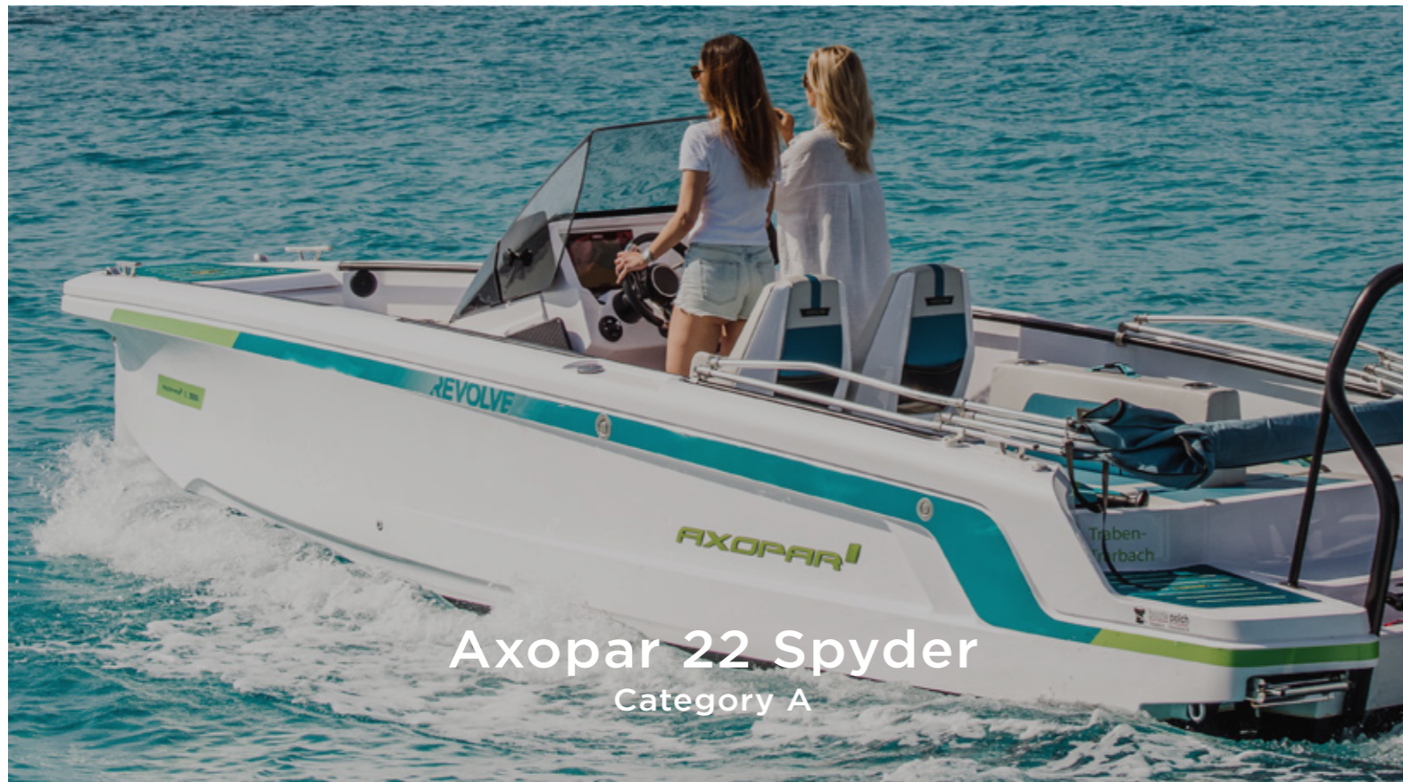
Axopar 22 Spyder Category A