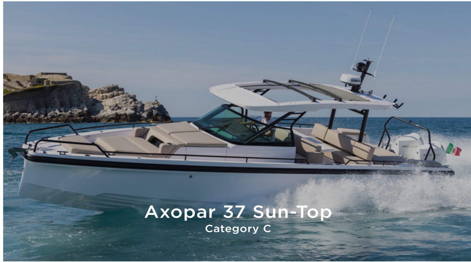
Axopar 37 Sun-Top Category C