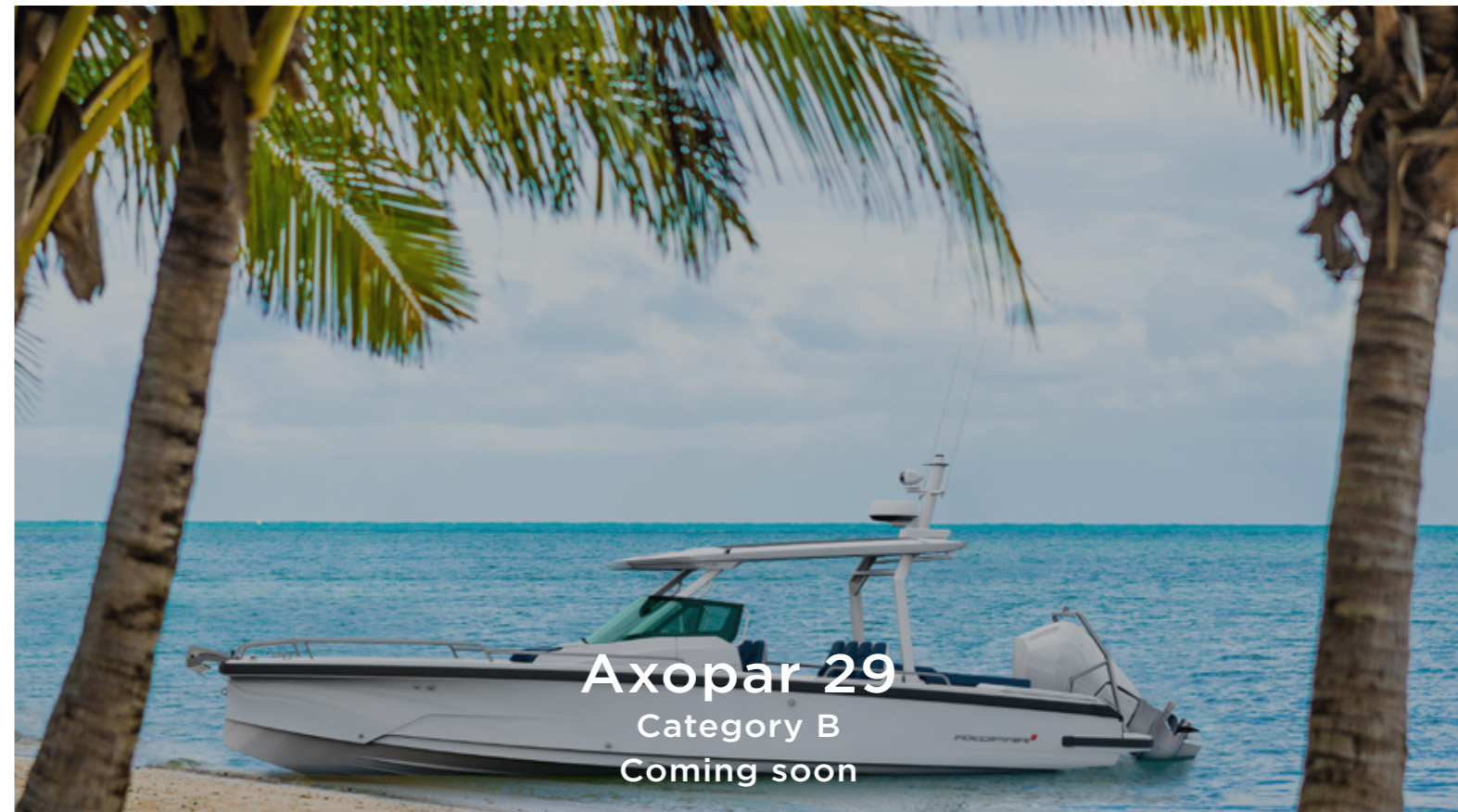
Axopar 29 Category B Coming soon