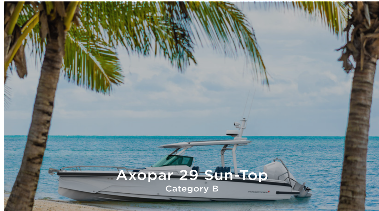
Axopar 29 Sun-Top Category B