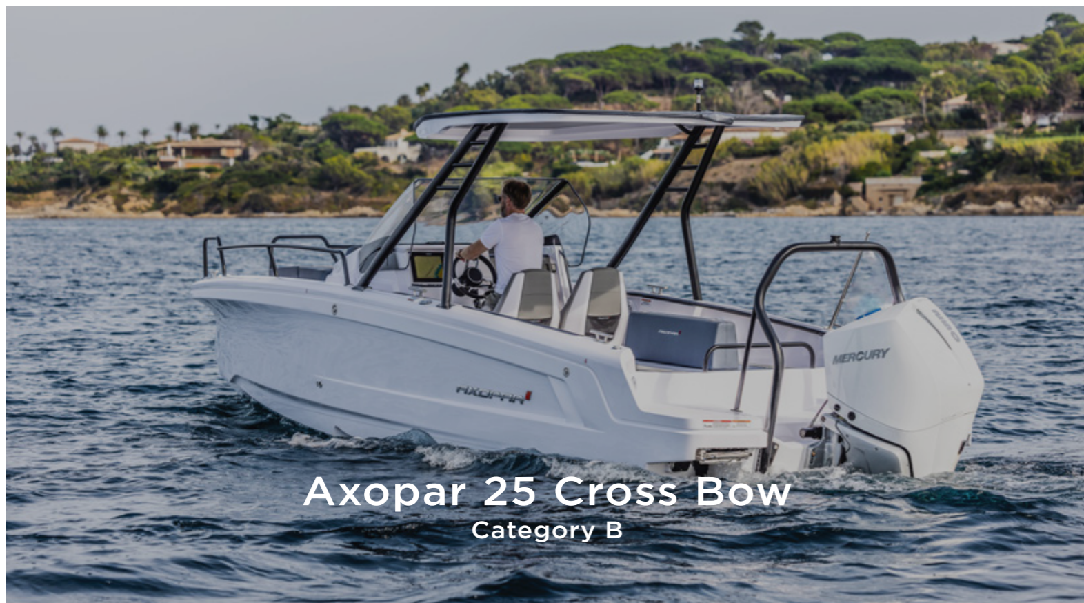
Axopar 25 Cross Bow Category B