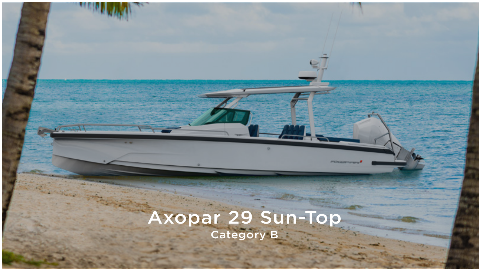
Axopar 29 Sun-Top Category B