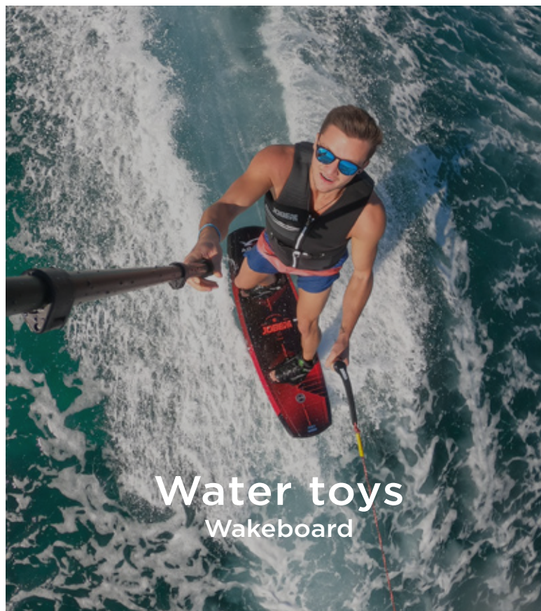
Water toys Wakeboard