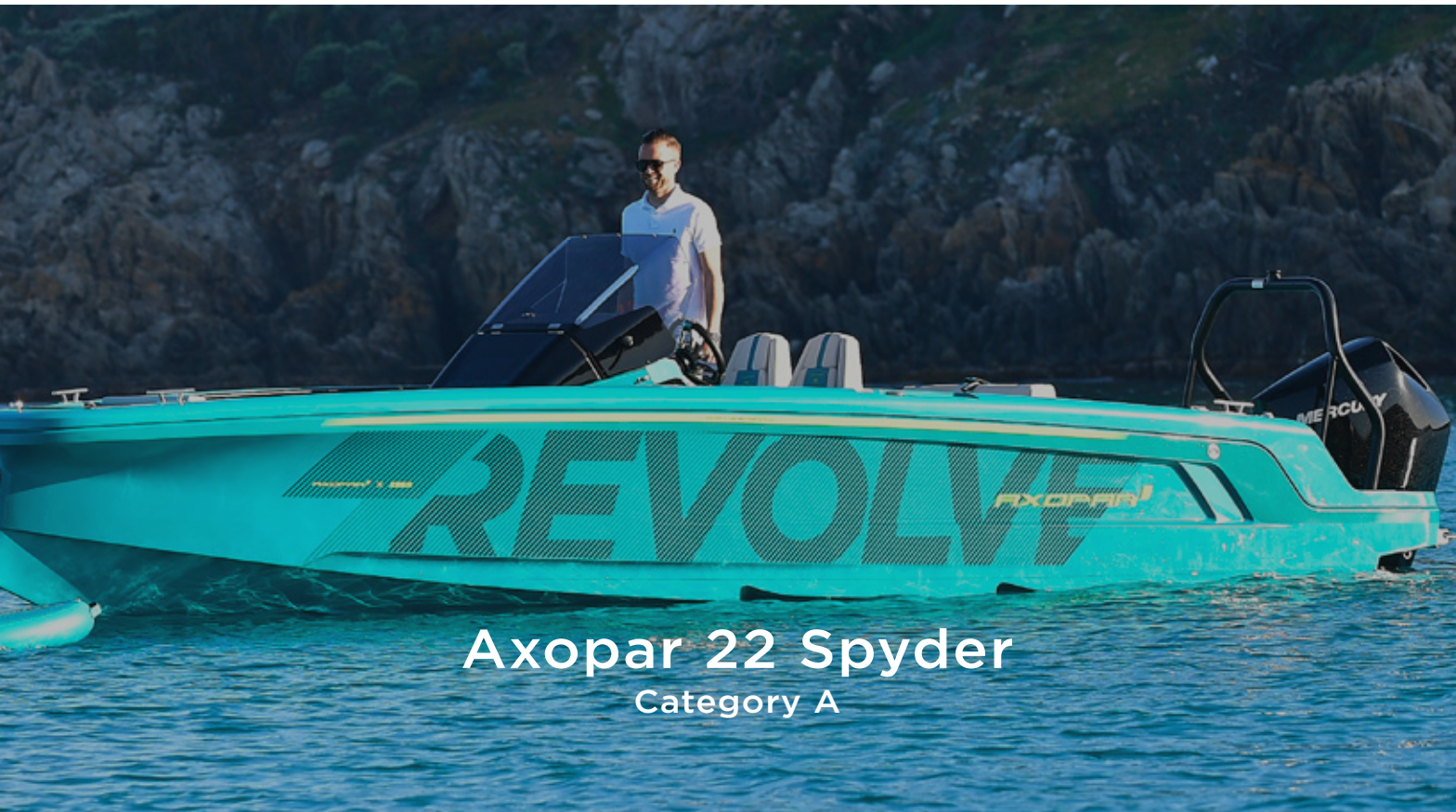
Axopar 22 Spyder Category A