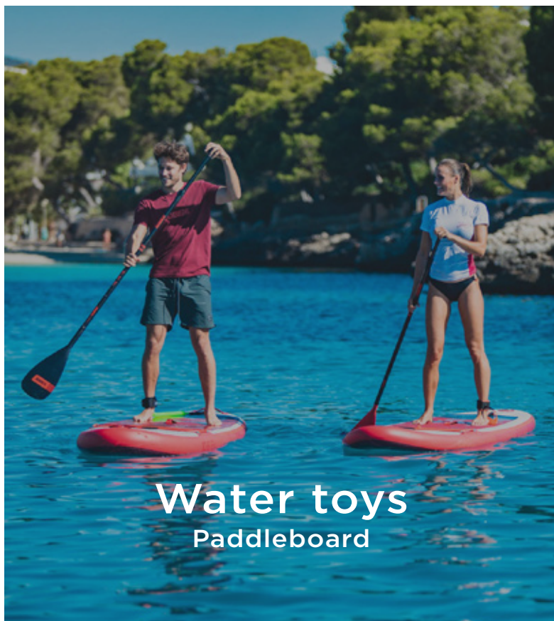
Water toys Paddleboard