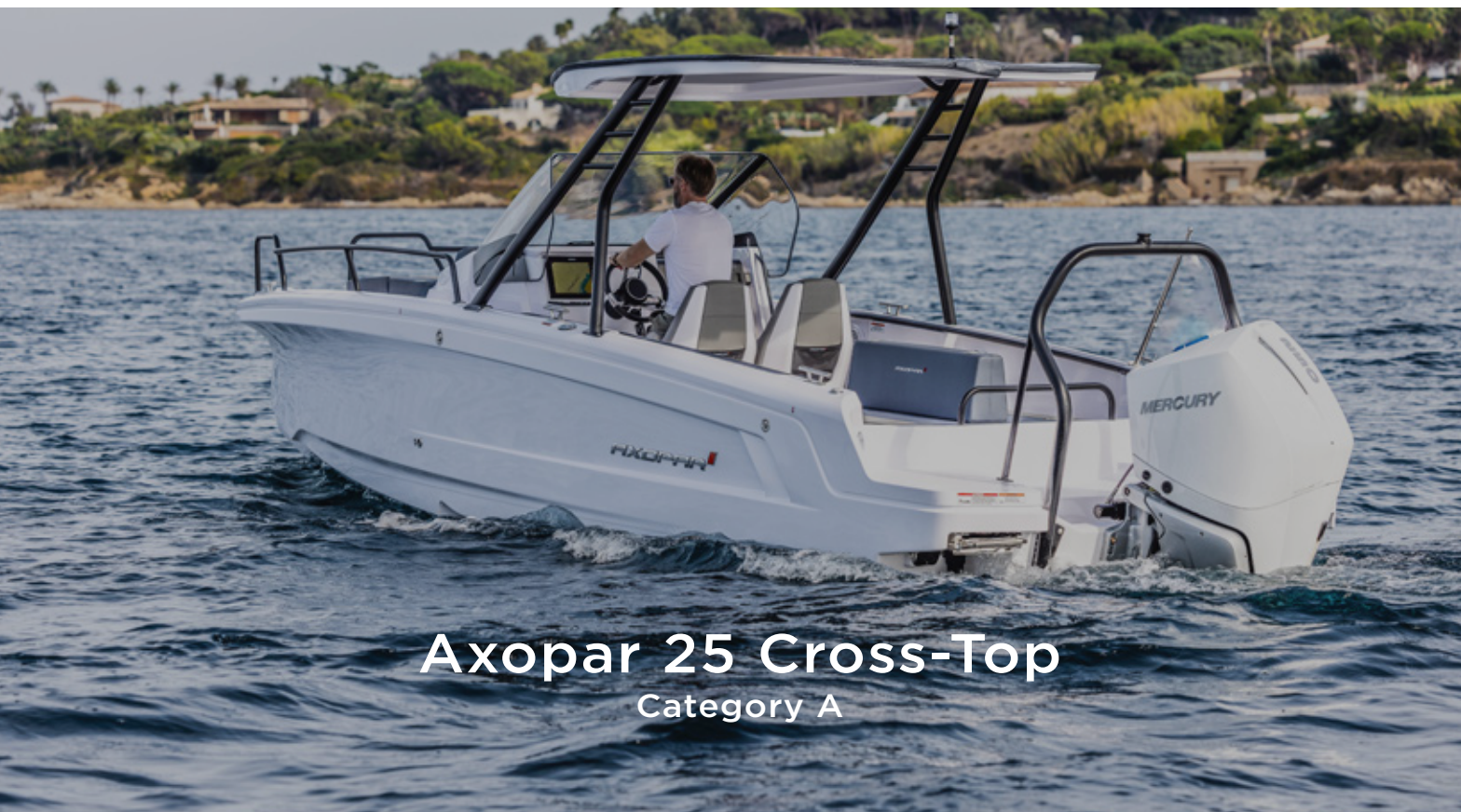
Axopar 25 Cross-Top Category A