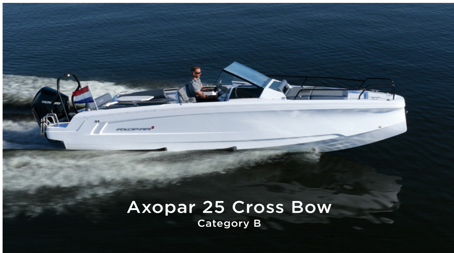
Axopar 25 Cross Bow Category B