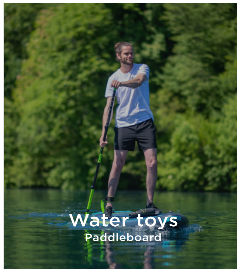
Water toys Paddleboard