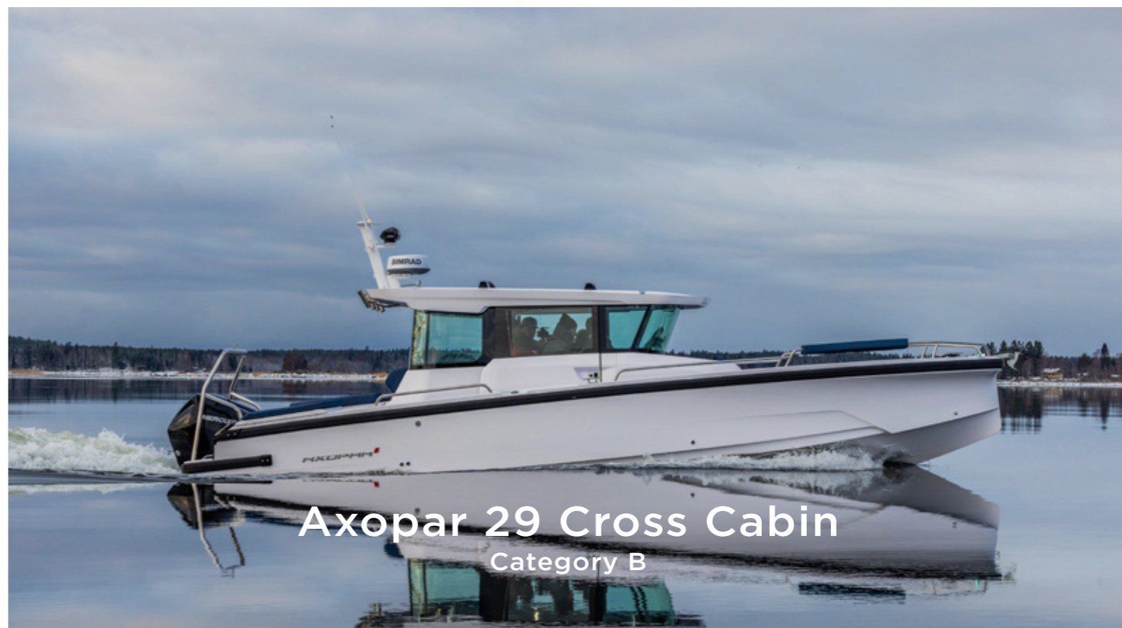
Axopar 29 Cross Cabin Category B