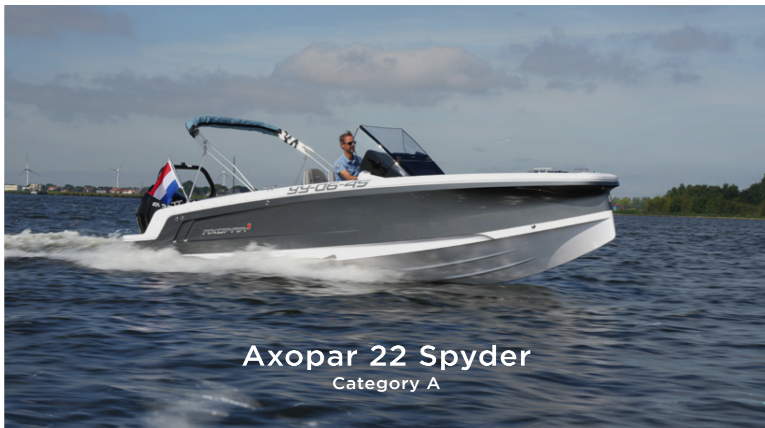
Axopar 22 Spyder Category A