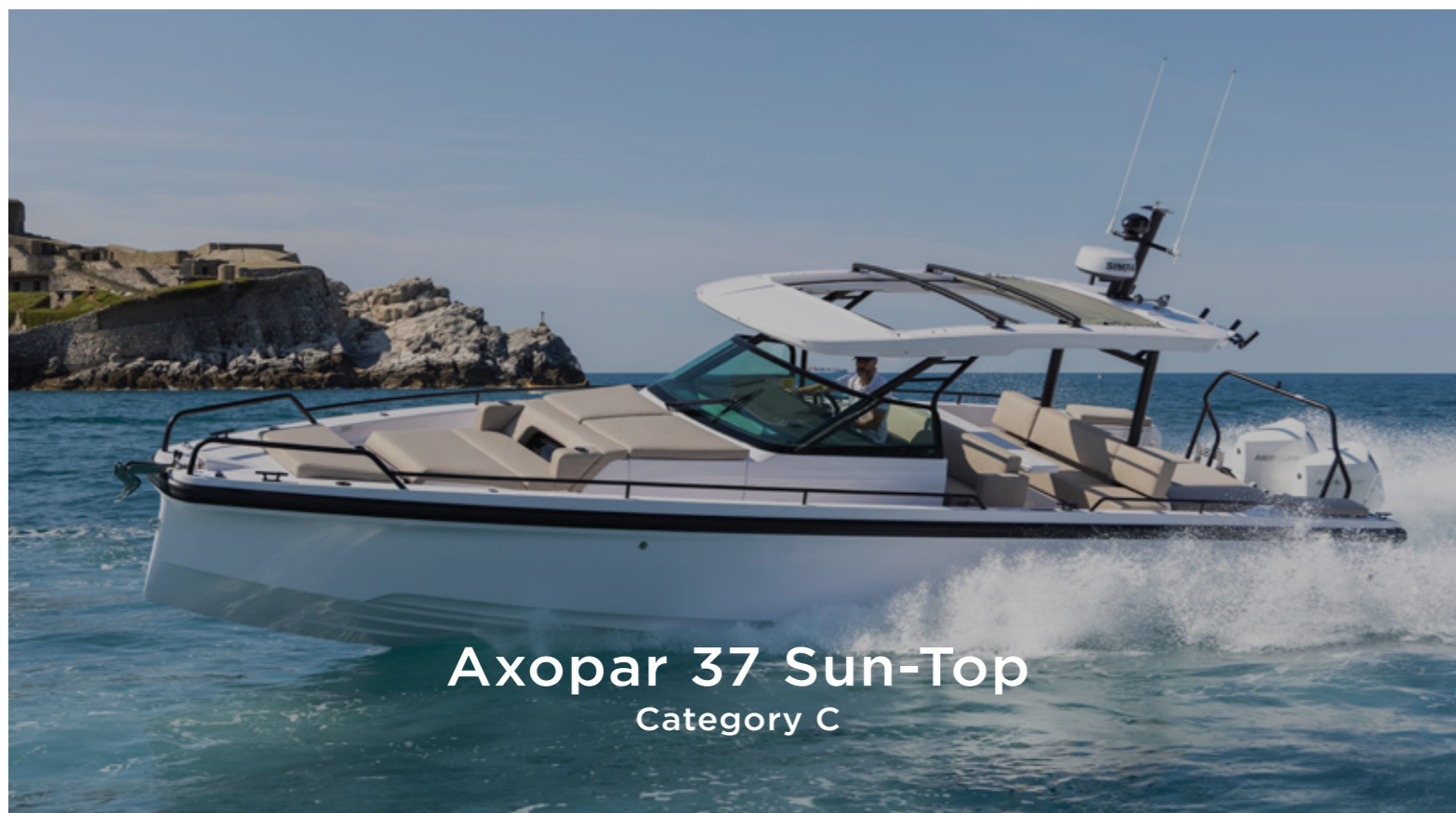
Axopar 37 Sun-Top Category C