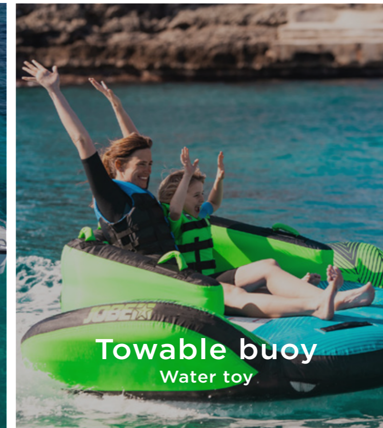
Towable buoy Water toy