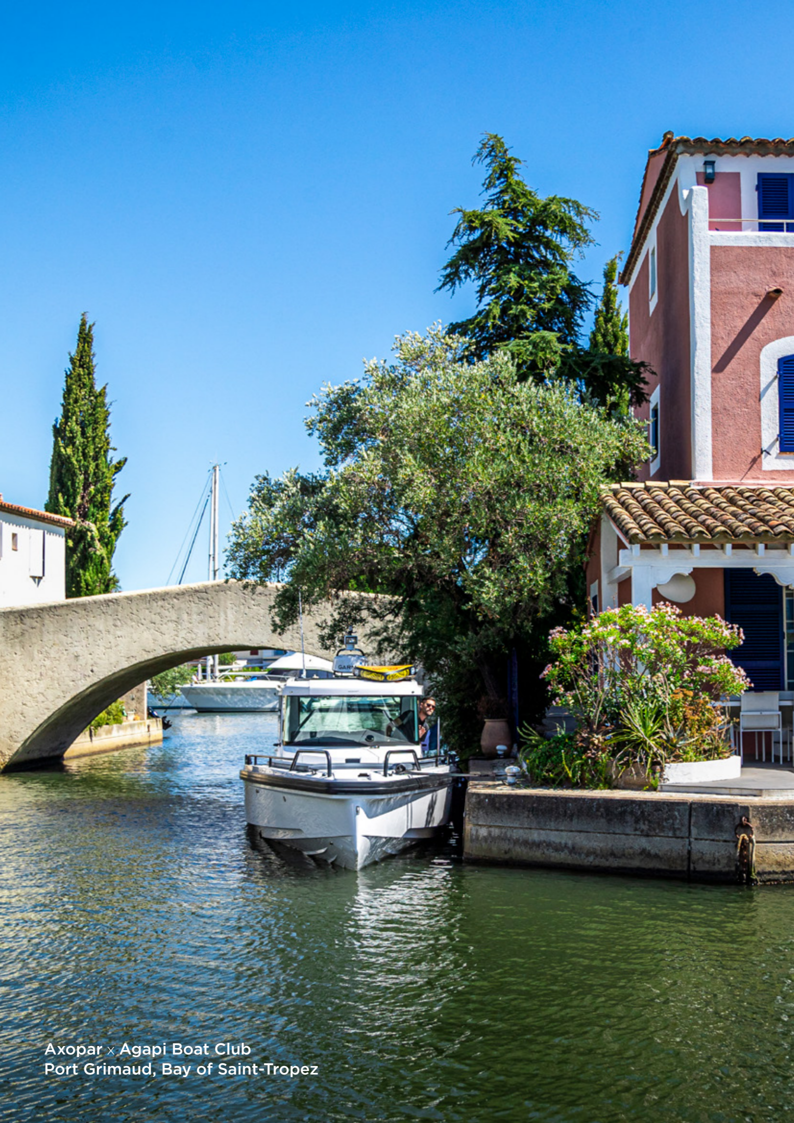
Axopar x Agapi Boat Club Port Grimaud, Bay of Saint-Tropez