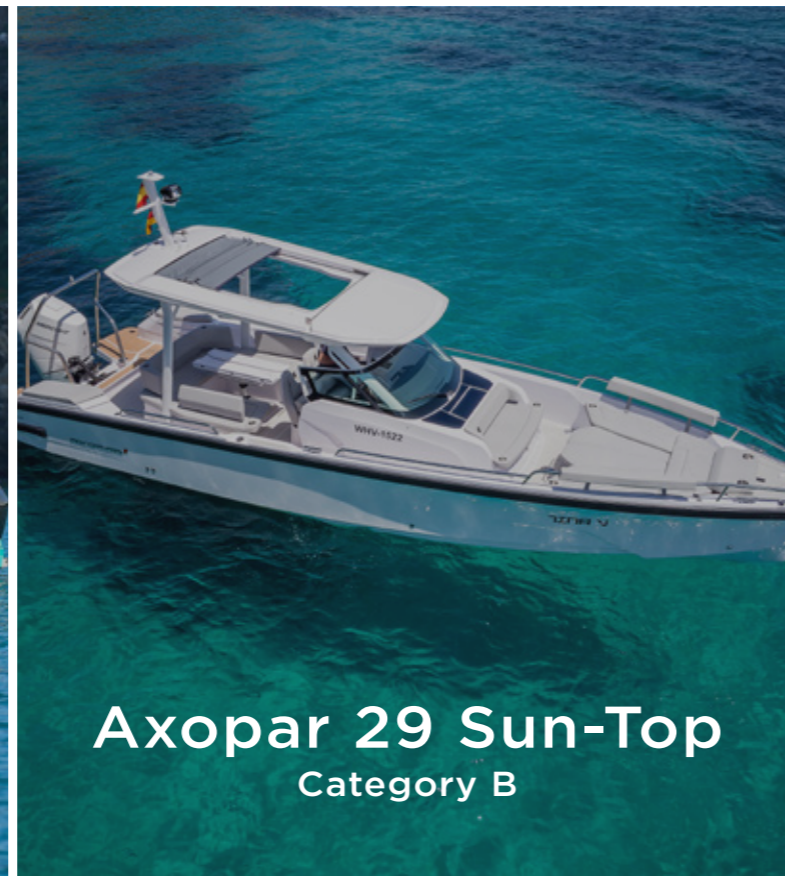
Axopar 29 Sun-Top Category B