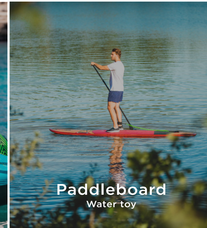
Paddleboard Water toy