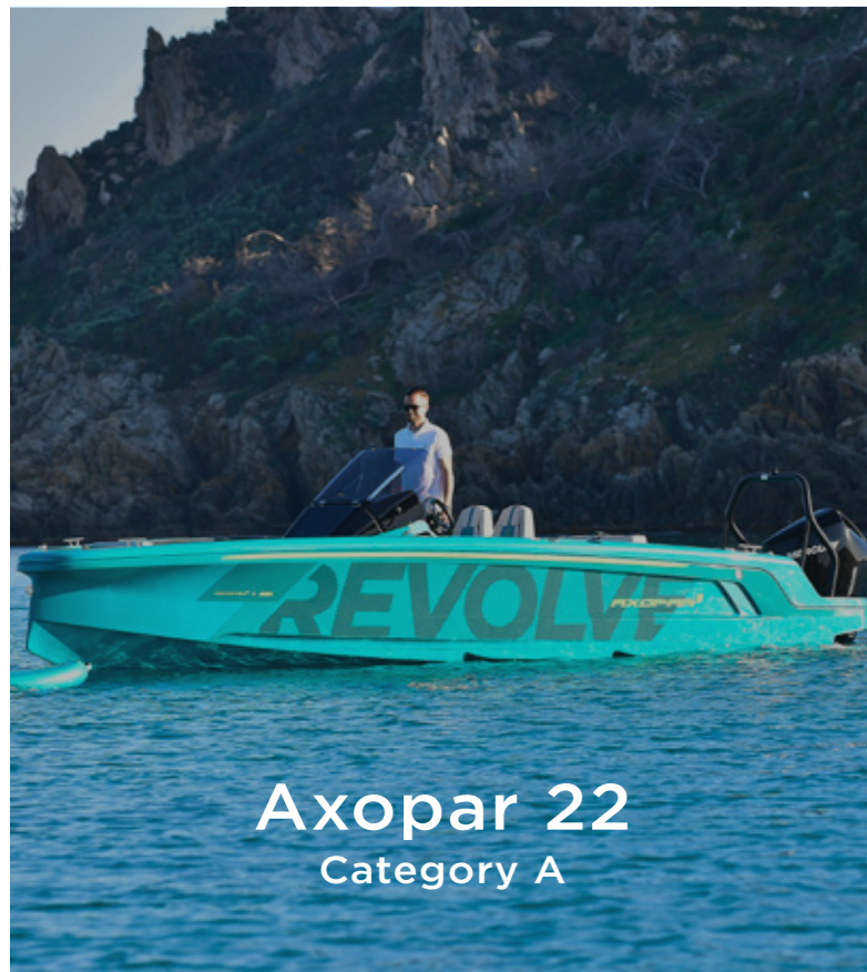
Axopar 22 Category A