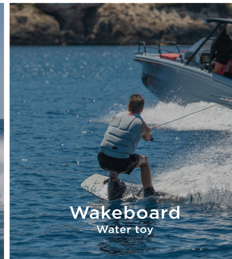
Wakeboard Water toy