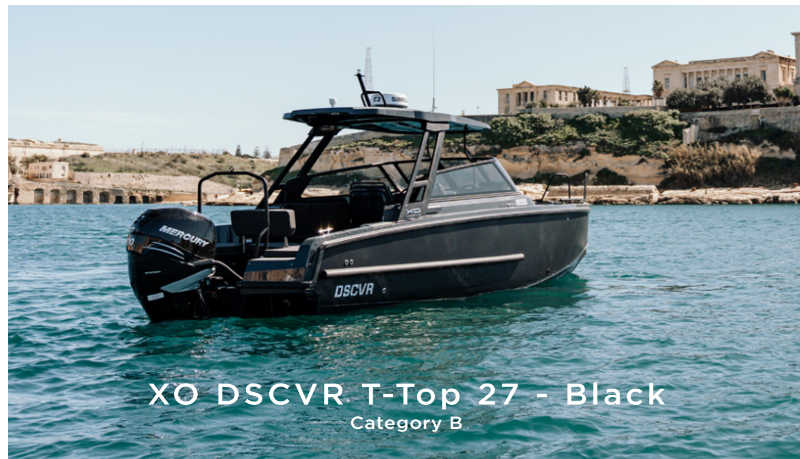
XO DSCVR T-Top 27 - Black Category B