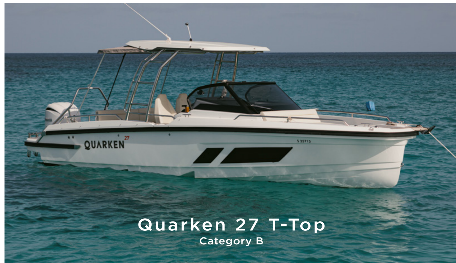
Quarken 27 T-Top Category B