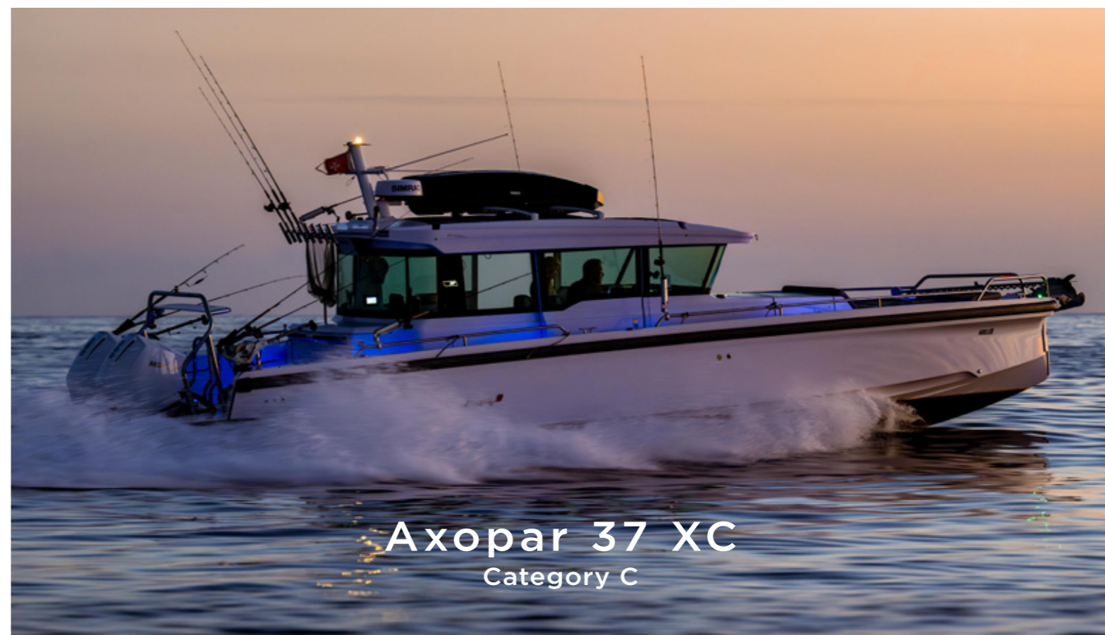
Axopar 37 XC Category C