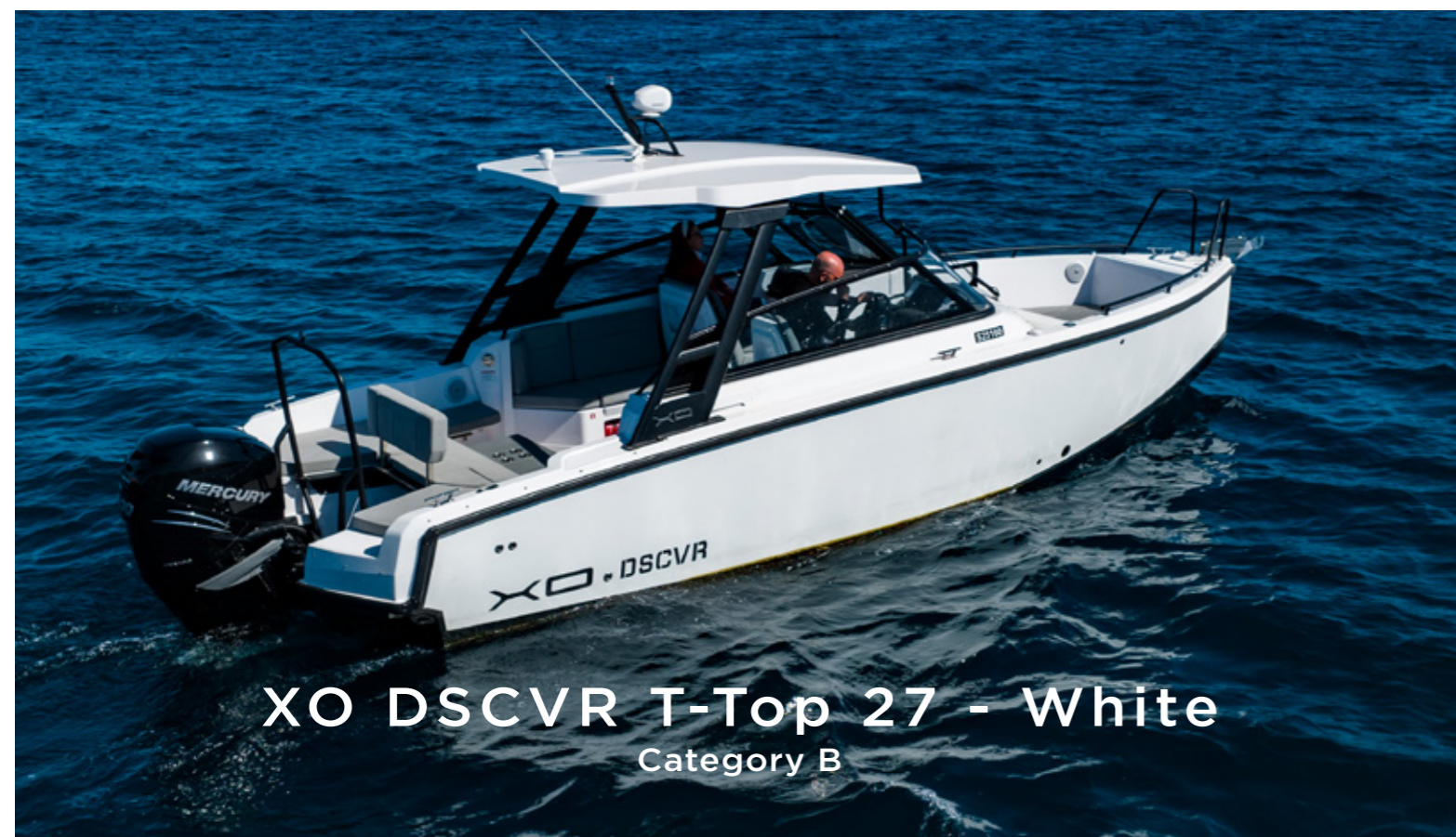
XO DSCVR T-Top 27 - White Category B